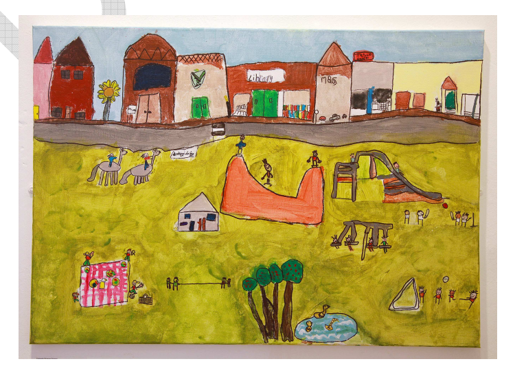
From My Bracknell Forest Art Exhibition