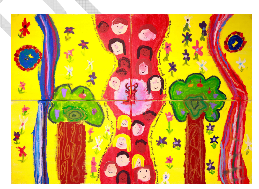
From My Bracknell Forest Art Exhibition