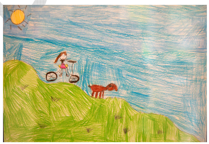
From My Bracknell Forest Art Exhibition

We look forward to being able to put this plan into action and reporting on our progress in a year's time.