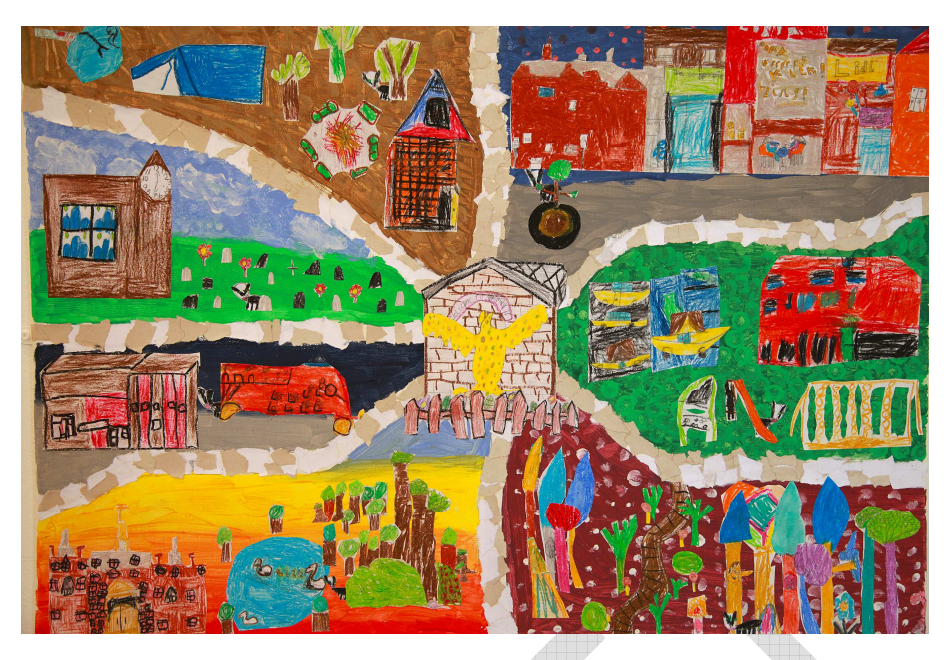
From My Bracknell Forest Art Exhibition